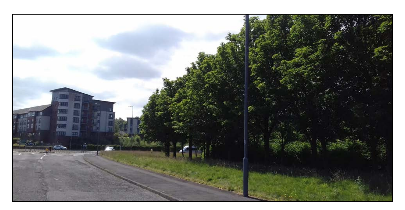
View of north boundary of site with Cartsdyke Avenue looking south-east towards the Cartsdyke Roundabout

The proposed development, particularly the proposed drive thru, has the potential to generate noise through vehicle movements, vehicle doors opening and closing, vehicles starting up as well as smells through food preparation/cooking. The nearest residential properties are approximately 80m to the east and across the A8. The existing traffic on this major route in and out of Greenock results in high background noise levels. Given the separation distance between the development and the nearest residential properties when combined with existing noise levels, the noise generated by the development would not significantly increase noise levels to adversely affect residential amenity. It should be noted that the Head of Service — Public Protection and Covid Recovery has no comments to make on the proposed development in terms of noise. It is also considered that the other uses in the surrounding area, including the nearby residential properties, would not be subjected to cooking odours that would affect their amenity given the type of food and drink offered by the intended occupier and the separation distances. The proposed development would be considered to avoid conflict with adjacent uses and in turn meet the quality of being 'Safe and Pleasant' of both the adopted and proposed Local Development Plans.