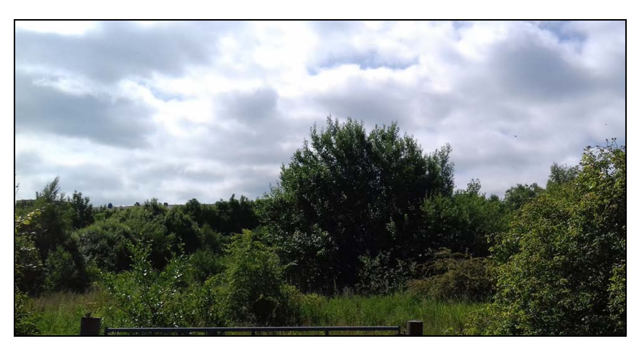
View of interior of site looking south-east from Cartsdyke Avenue

Policy 5 of Clydeplan requires local authorities to safeguard and promote investment in the Strategic Economic Investment Locations (SEILs) to support their dominant role and function, being green technologies/business and financial services at Inverclyde Waterfront, and to address the opportunities/challenges as identified in Schedule 3 to the policy. This may include providing opportunities for the expansion or consolidation of these locations, where appropriate, and to identify the locations and circumstances when other uses commensurate to the scale of the SEILs non-dominant role and function will be supported. The "Implementing the Plan and Development Management" section of the Plan should be taken into account when considering non-dominant role/function uses within the SEILs.