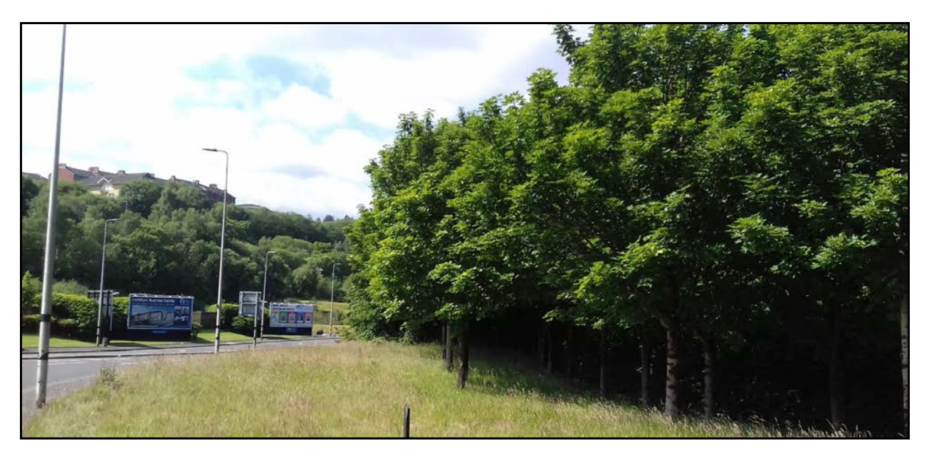
View of east side of site bordering Main Street looking south

When considering the above factors it is considered that the proposed drive thru coffee shop part of the proposal is acceptable under Policy 22 of the adopted Local Development Plan and Policy 23 of the proposed Local Development Plan.